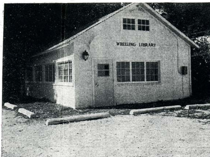
The new community library will open its doors to booklovers young and old Saturday morning to accept applications for library cards. The transformed building is located in the rear of the Union Hotel parking lot.

officials, to demonstrate the need for a public library. In February of 1958 the State felt that the suburban growth warranted the operation of a library. The Wheeling Public Library opened officially on Saturday, October 4, 1958, with an open house that attracted