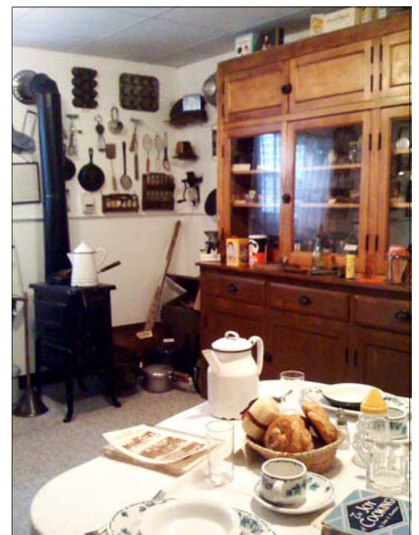
A view of our museum's kitchen